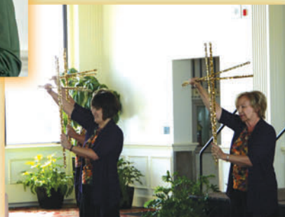
Ministry through Dance

Our true beauty can never be captured on its own. Rather, it is who we are together. Each of us represents a thread. It is God who joins us and knits us into a beautiful piece of tapestry one that pleases Him. Each of us is a reflection of Jesus. We are each uniquely gifted. Each thread bears its own significance just like we see in Rahab, Mary, Elizabeth, the woman with the issue of blood, and Dorcas. God is transforming us into the very image of His Son. He is not finished with us yet. We are threads joined and knitted together in the love of God through Jesus Christ.