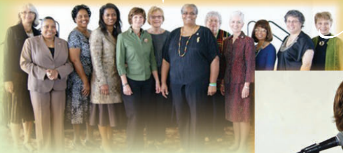
Outgoing and Incoming NABWU Officers