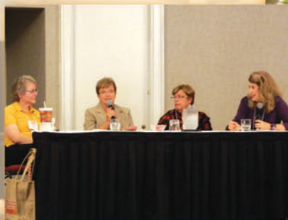
Panel Discussion on Human Trafficking